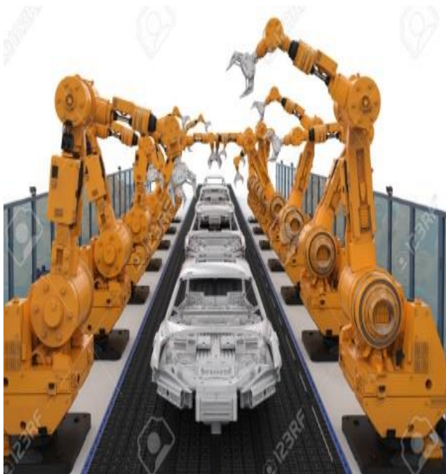
Pick & place of Arm