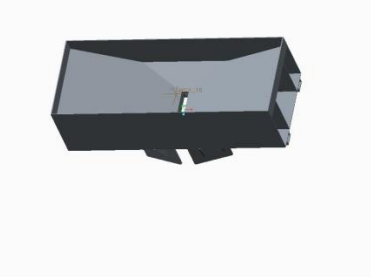
Figure 4.4 Hopper

The rational method for hopper design is based on a model of stress distribution in the hopper, informed by measurements of the flow properties of the material being handled, that predicts the flow pattern that will occur and whether or not flow will be reliable. The details can be found in any standard text of powder technology so will not be repeated here.