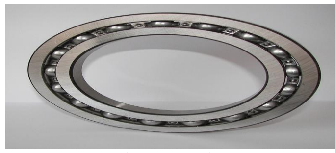
Figure 5.2 Bearing

Due to early industrial necessity for bearings, many thrust pad bearings were theoretically studied in the 1950s by investigators for design and development of good performing bearings. It has been observed that in the past many researchers have analyzed thrust bearings having various surface profiles on the pads have reported higher load carrying capacity with Lubricated Bearings stepped pad thrust bearing in comparison to the conventional plane inclined thrust bearing.